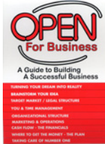
Open for Business© Entrepreneurship