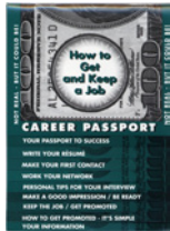
Career Passport© Job Search Skills