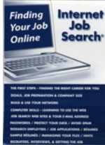
Internet Job Search©