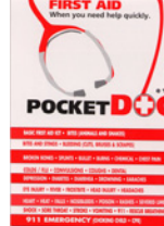
PocketDoc© First Aid for Us