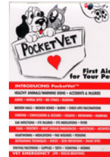
PocketVet© First Aid for Pets

Information... in the palm of your hand™ for over 21 years