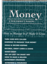
Money© Financial Literacy